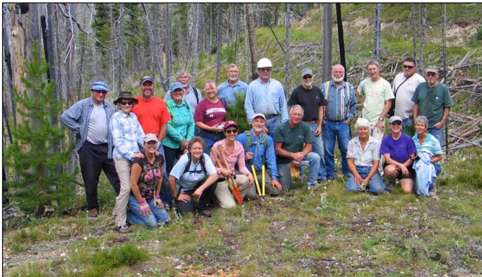
THE BACK COUNTRY HORSEMEN, BITTERROOT BACKCOUNTRY CYCLISTS, & BITTERROT CROSS-COUNTRY SKI CLUB MEMBERS FORMED A PARTNERSHIP TO CLEAR TRAIL AT CHIEF JOSEPH PASS.