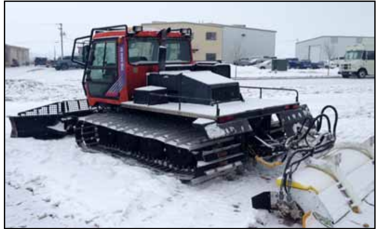
THIS IS THE MACHINE THAT WILL BE GROOMING OUR TRAILS NEXT SEASON. IT WILL HAVE 2 TRACK-SETTERS ATTACHED BEFORE DELIVERY TO LOST TRAIL.

Fortunately, over the summer Lost Trail purchased a narrower machine which will fit on the Chief Joseph Trails. That machine will be used this coming ski season (2014-15) to groom all the trails at Chief Joseph Pass.