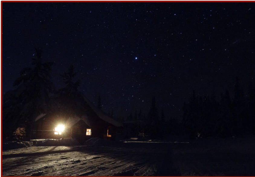
Gordon Reese Cabin, mid-January ski and stay.

I was lucky enough to spend a couple days at Chief Joseph Pass over the long MLK weekend, and while cold, the snow was wonderful. We were able to watch the sled dog teams go by, and had perhaps the nicest night ski I can remember.